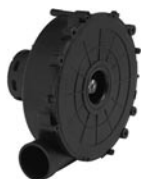
FIG. K A123