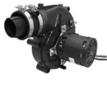
FIG. H A225