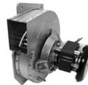
FIG. I A226