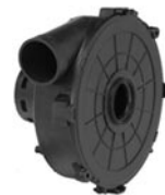
FIG. N A178