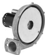
FIG. A A272, A273, A274

NOTES: 51: Includes centrifugal switch 133: 4M 250V Capacitor included 135: Leads require modification