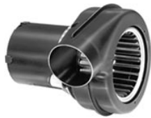
FIG. F A085