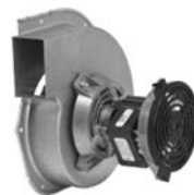
FIG. D A361