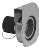
FIG. H A373