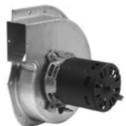
FIG. F A241