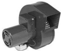
FIG. A A087

NOTES: 51: Includes centrifugal switch 133: 4M 250V Capacitor included