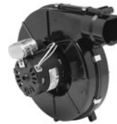
FIG. I A171