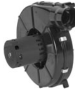
FIG. H A170