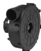
FIG. N A209