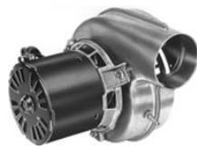
FIG. B A135, A138