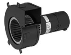
FIG. J A245