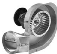
FIG. M A126