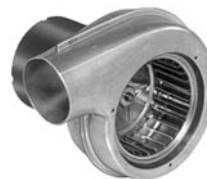
FIG. D A164