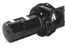
FIG. R A075