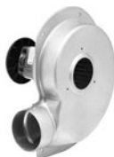
FIG. L A100