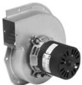
FIG. F A223