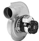
FIG. O A234