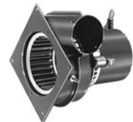
FIG. J A128