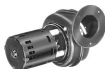
FIG. L A063