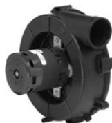
FIG. H A203