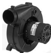
FIG. H A243