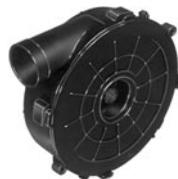
FIG. C A163