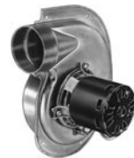
FIG. D A141, A174, A301