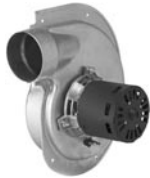
FIG. G A169