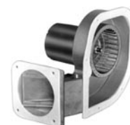
FIG. O A154