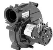
FIG. J A227