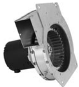
FIG. A A218

NOTES: 50: Stainless steel shaft 134: Replacement for Airease, Armstrong and Magic Chef