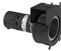
FIG. I A244