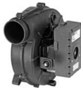
FIG. C A190