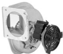
FIG. K A228