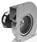
FIG. L A269