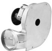
FIG. K A198, A199, A260, A261, A262, A263, A264, A265, A266, A267, A268