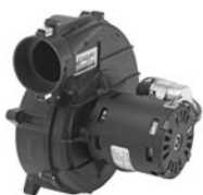
FIG. K A246