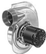
FIG. B A134, A177, A302, A304