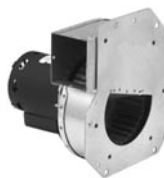
FIG. M A270