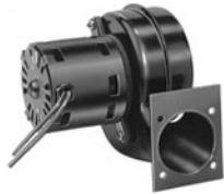
FIG. F A151