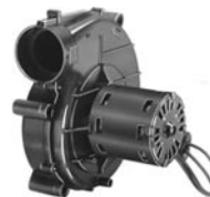
FIG. D A142