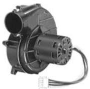
FIG. A A136

NOTES: 20: 4M 370V Capacitor included 51: Includes centrifugal switch