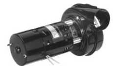
FIG. O B23618