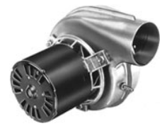
FIG. J A205