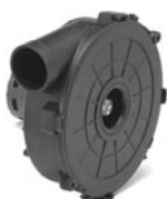
FIG. P A211