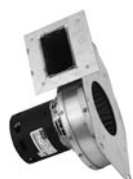
FIG. Q A217