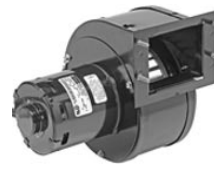
FIG. D A191