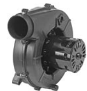
FIG. J A197