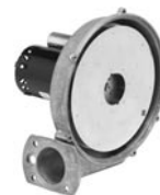
FIG. N A271

Thermally protected • UL recognized • CSA or ULc certified NOTE: Rotation is determined by looking at shaft end. Shaft length is measured from motor face.