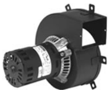
FIG. A A306