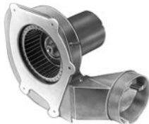
FIG. G A155