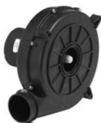
FIG. L A124