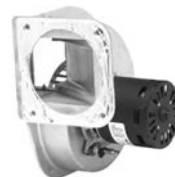
FIG. N A231