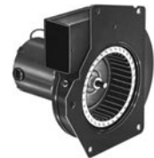
FIG. E A148