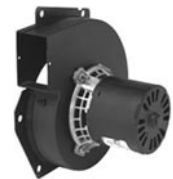
FIG. O A179

Thermally protected • UL recognized • CSA or ULc certified