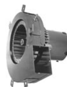
FIG. N A079