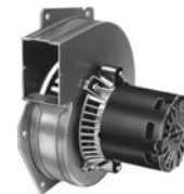
FIG. E A367