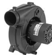
FIG. I A196