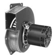
FIG. O A143