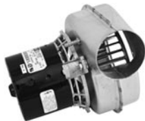
FIG. B A219