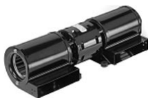
FIG. Q A111