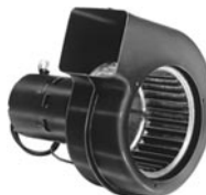
FIG. M A159