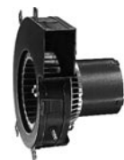
FIG. O A090

Thermally protected • UL recognized • CSA or ULc certified NOTE: Rotation is determined by looking at shaft end. Shaft length is measured from motor face.