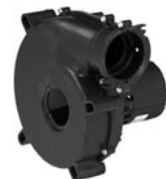
FIG. J A189, A280, A283