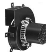
FIG. J A080