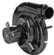
FIG. K A173