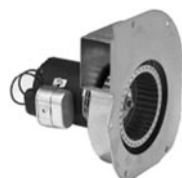
FIG. G A369, A370