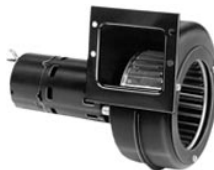
FIG. H A161