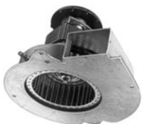
FIG. A A157