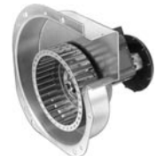
FIG. E A160