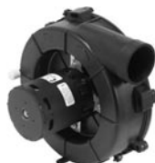
FIG. C A180