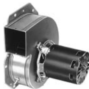
FIG. C A129