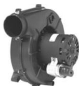
FIG. F A368