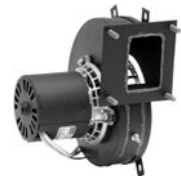
FIG. E A222