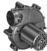
FIG. I A088