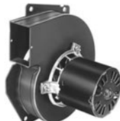
FIG. H A132