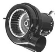
FIG. N A073