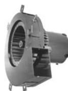
FIG. M A251