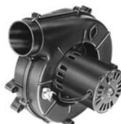
FIG. R A140

Thermally protected • UL recognized • CSA or ULc certified NOTE: Rotation is determined by looking at shaft end. Shaft length is measured from motor face.