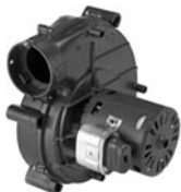
FIG. B A168