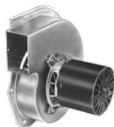
FIG. G A185, A286, A287, A288