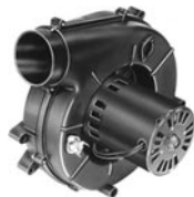
FIG. M A285