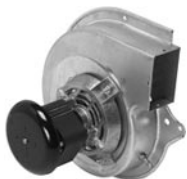
FIG. F A184