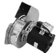
FIG. E A331