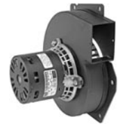
FIG. E A192