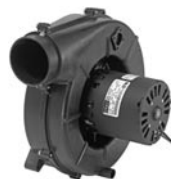
FIG. B A276