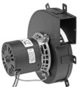
FIG. F A193