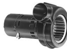
FIG. N B23617