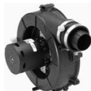
FIG. G A202