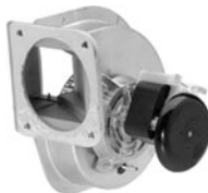
FIG. L A229