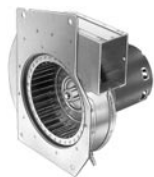
FIG. K A156