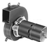
FIG. M A144