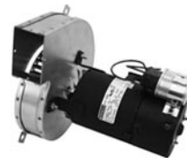
FIG. D A324