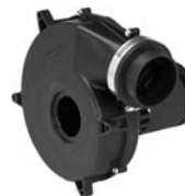
FIG. I A188