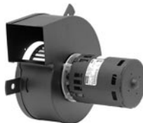
FIG. C A220