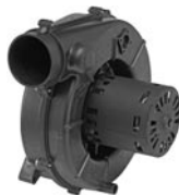
FIG. H A195