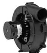
FIG. I A204