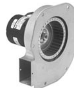
FIG. I A121