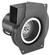
FIG. B A150