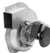
FIG. D A181, A289