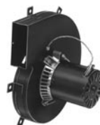
FIG. I A118