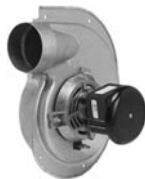
FIG. M A176