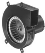
FIG. A A064