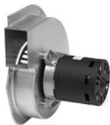
FIG. G A194