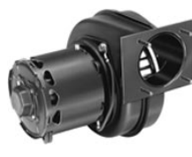
FIG. Q A069