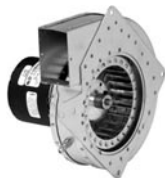
FIG. L A282