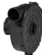
FIG. N A290