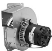
FIG. K A206