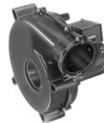
FIG. D A158