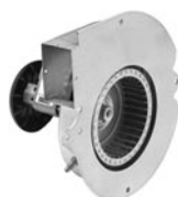
FIG. M A208