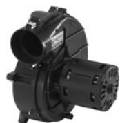
FIG. L A247