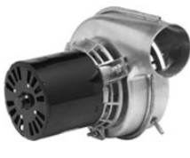
FIG. F A201