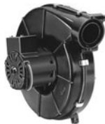
FIG. C A145