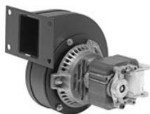
FIG. P A110