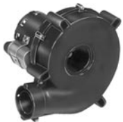
FIG. A A165