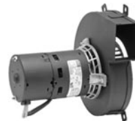
FIG. D A221