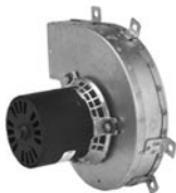
FIG. K A281, A284