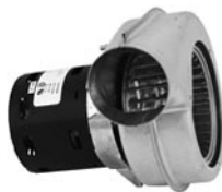
FIG. C A322