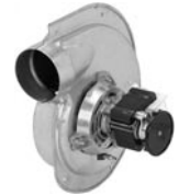
FIG. J A172