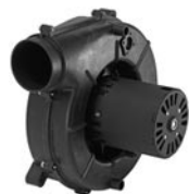
FIG. G A242