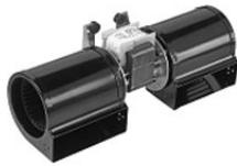
FIG. B A120