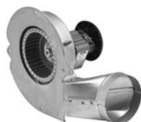
FIG. L A207