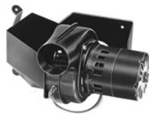
FIG. B A139