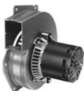
FIG. P A146