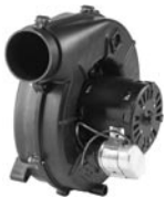
FIG. A A130