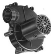
FIG. C A086