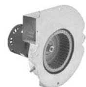
FIG. O A210