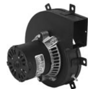
FIG. E A240