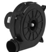
FIG. J A122