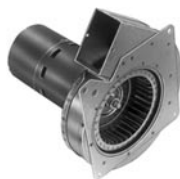
FIG. B A162