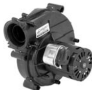
FIG. M A230