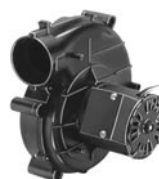
FIG. N A137