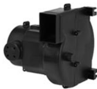
FIG. L A175