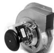
FIG. E A182